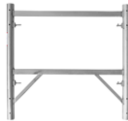
4 X 4 FRAME (1.22 m x 1.22m) 22.0 lb / 10.0 kg