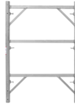
4 X 6 FRAME (1.22 m x 1.83 m) 32.0 lb / 14.5 kg